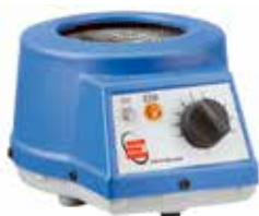
IH1180 Heating only