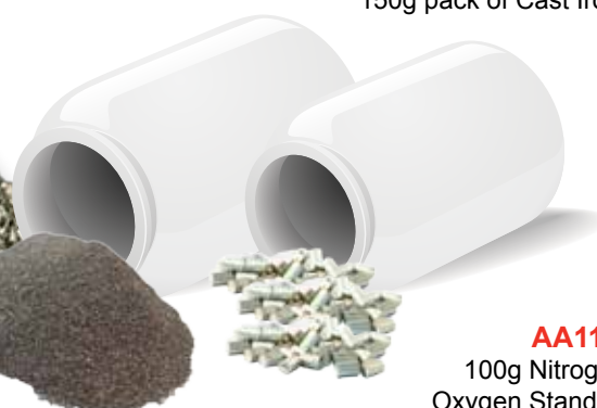
AA1110 100g Nitrogen/Oxygen Standard Steel Pins.