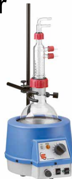
Heating Mantle in use with round bottom flask.