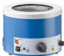
IH1170 Heating & Stirring