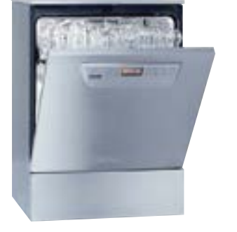
ROWE CODE ID0236 or ID0104 *Depending on RO water supply

VALID UNTIL 31 AUGUST 2024 INSTALLATION & COMMISSIONING ROWE CODE IC0502