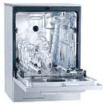
ROWE CODE IG0047