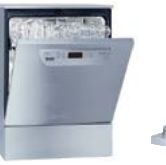
ROWE CODE CD1543