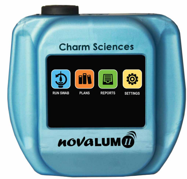
Rowe Code IM0216