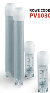
ROWE CODE PV1030