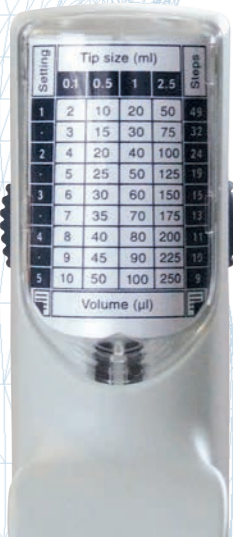
Volume table HandyStep® S with PD-Tips

The double-sided volume table on the back side shows all the necessary stroke setting information at a glance.