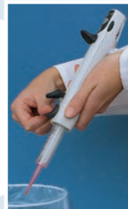
Dispenser tip ejection

Safe! At the push of a button! Ergonomic eject button for contact-free, safe ejection of contaminated dispenser tips.