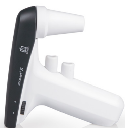
accu-jet® S, anthracite