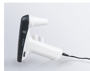
Smart charging technology prevents lazy battery effect