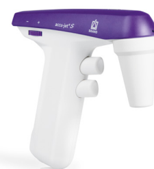
accu-jet® S, amethyst