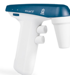
accu-jet® S, petrol