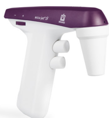
accu-jet® S, berry